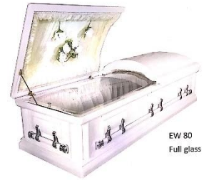
EW 80 Full glass