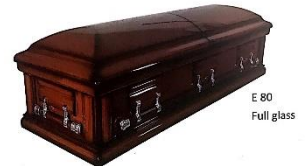
E 80 Full glass